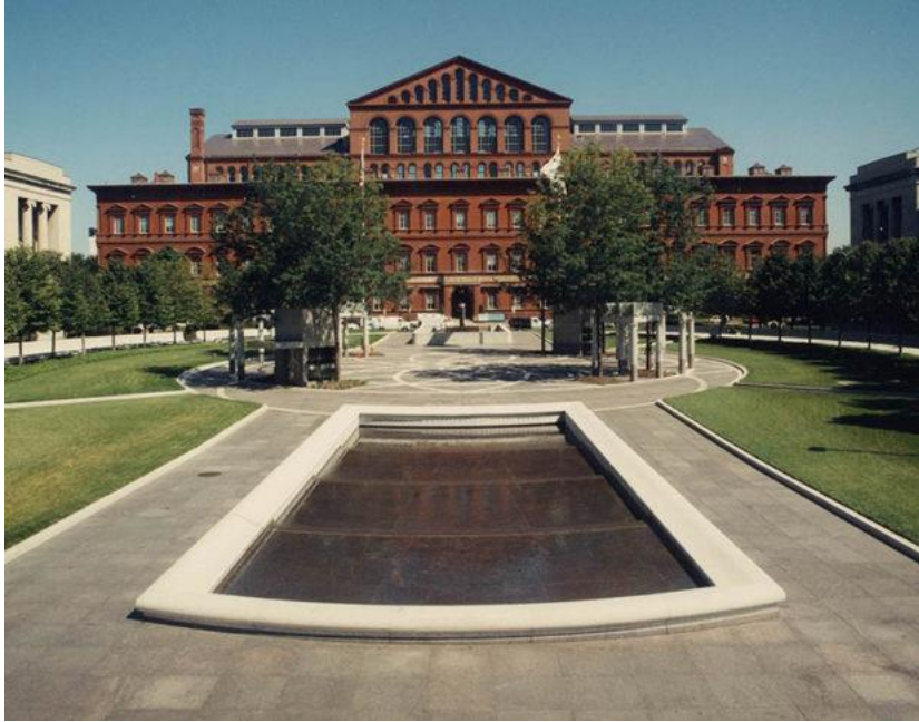
National Building Museum