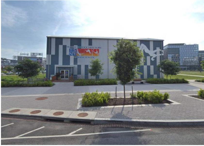
Trapeze School New York, Washington, D.C.