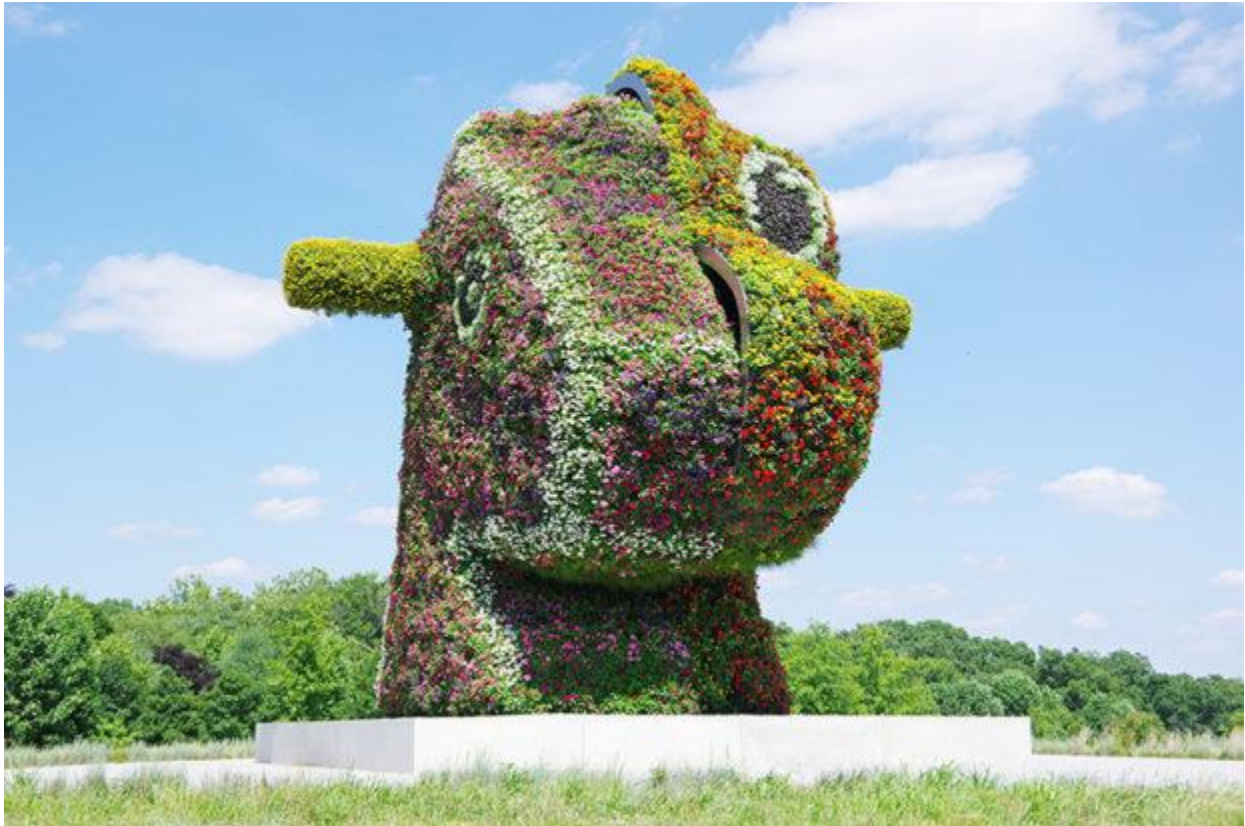
Split Rocker by Jeff Koons at Glenstone Museum

A real “wow” in the D.C. area is Glenstone. This privately owned modern art museum is set on 230 acres of suburban rolling meadows, woodlands, and streams, with a 204,000-square-foot building and more, all filled with wonderful post-World War II art. You’re invited to stroll the grounds, join an outdoor sculpture tour, talk about art with the guides, appreciate the architecture and relax by the lushly planted Water Court. Oh, and make sure to enjoy the cafes. Glenstone is free, but you should make reservations. It’s open Thursday through Sunday, 10 a.m. to 5 p.m. and is located at 12100 Glen Road, Potomac, Maryland.