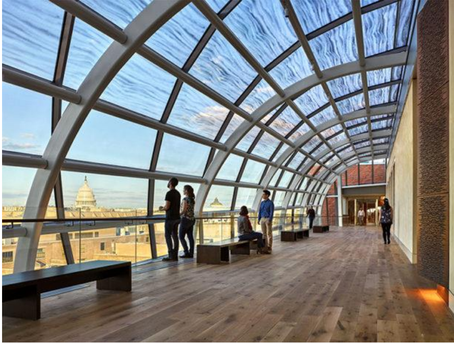
Museum of The Bible