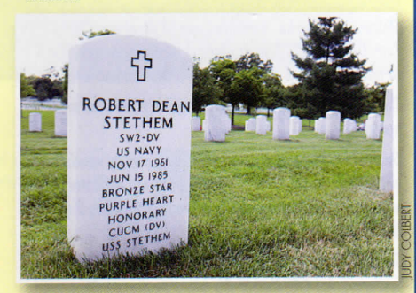
Stethem's grave is at Arlington National Cemetery.