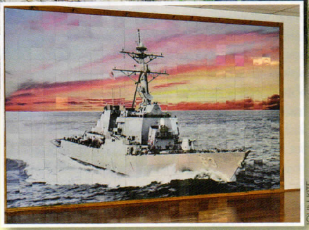
A tile mural of a ship named after Stethem is displayed at the Stethem Educational Center in Pomfret.

Stethem was born on November 17, (Continued on page 14.)