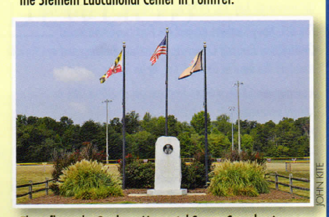
Flags fly at the Stethem Memorial Sports Complex in Waldorf.