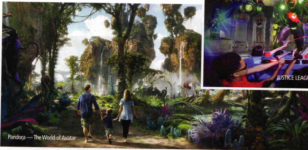
Pandora — The World of Avatar

Disney World presents us with a world of floating mountains, bioluminescent rainforests and soaring Banshees in Pandora — the World of Avatar. James Cameron's 2009 movie comes to life this summer in Disney's Animal Kingdom. A seven-hour guided