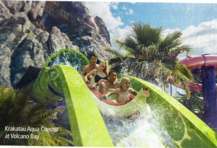
Krakatau Aqua Coaster at Volcano Bay

the 200-foot Krakatau volcano where you board canoes and propel downwards and upwards through the volcano's interior peaks and valleys. Also new is TapuTapu wearable technology that lets you explore the rest of the park and only head to a ride when you're alerted that it's your time.